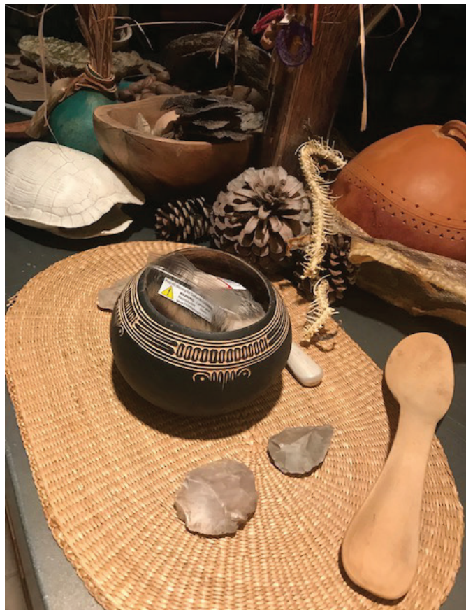
MUSEUM ON THE MOVE - Look for our Paleoscape at the Bosque Art Center Tablescapes, November 20th