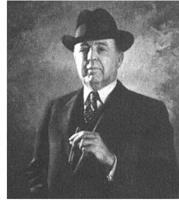
John A. Lomax

John Avery Lomax, raised in Meridian, was a folklorist and musicologist of note in the early 20th century. He documented the burgeoning music scene of the American South.